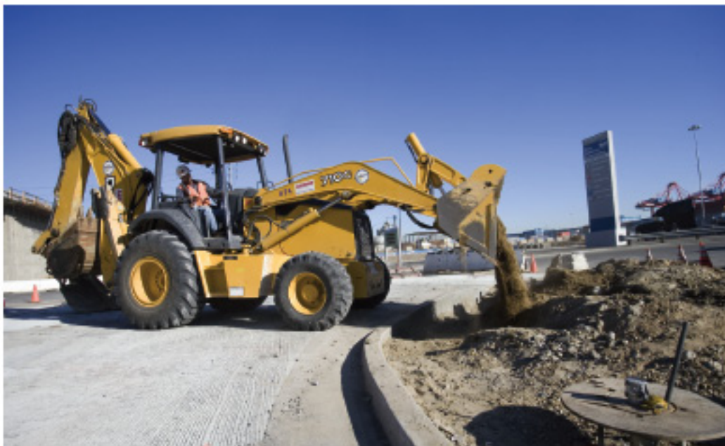
The Port, CalTrans and other agencies contributed funding for the project.